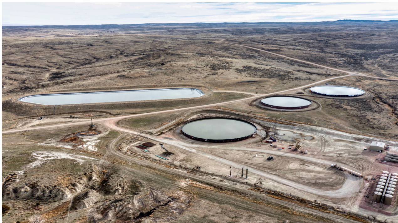
WATER TANKS AT A CUB CREEK PAD