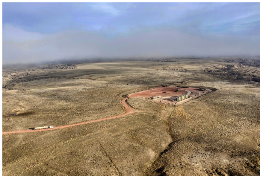
PRODUCTION FACILITIES IN WYOMING, USA

Current geopolitical developments underline the importance of Sangdong and Almonty Industries as a major independent source of tungsten in the Western world. Deutsche Rohstoff remains convinced of the metallurgical-geological quality of the Sangdong deposit and its economic potential.